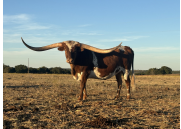
HRTMN Silver Topsannah